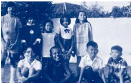
*President Barack Obama with friends.

Creative Foundation has never misused photos of our students and we are not going to start it now or ever. Hence, approval of photograph is recommended. See example below: