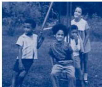
* VP Kamala Harris with friends.