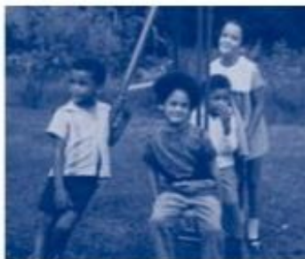
* VP Kamala Harris with friends.