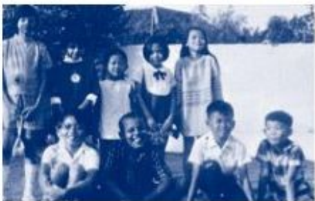
*President Barack Obama with friends.

Creative Foundation has never misused photos of our students and we are not going to start it now or ever. Hence, approval of photograph is recommended. See example below: